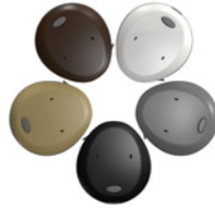
OSIA 2 SOUND PROCESSOR