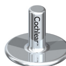
94071 Implant Magnet template*