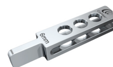
95070 Soft tissue gauge 6 mm*

* Instruments specific for Baha Attract System surgical procedure.