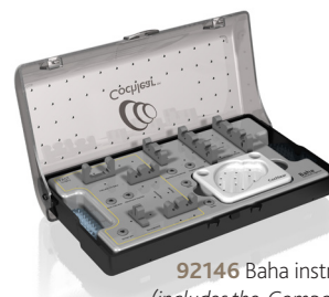
92146 Baha instrument organiser (includes the Component tray 92145)

NOTE: The below instruments are used for the Baha Attract System surgical procedure, with BI300 Implant and BIM400 Implant Magnet. Some of these instruments are also used for DermaLock™ surgical procedure, with BIA400 Implant and abutment.