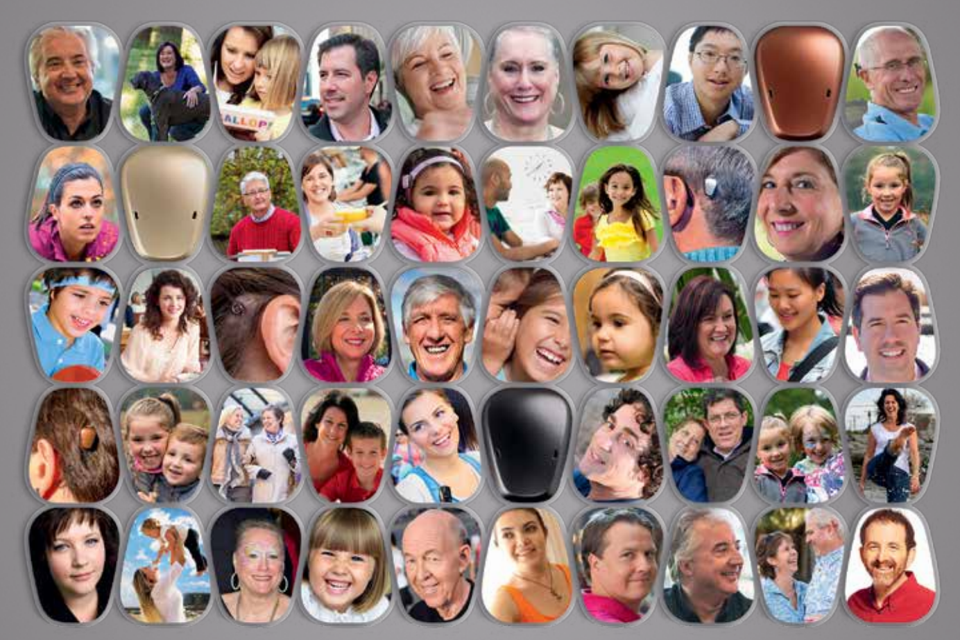
Cochlear Baha recipients from around the world